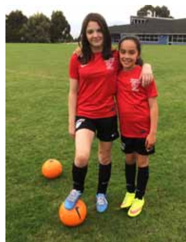
Girls ready for their skills training session

It is wonderful to see our inaugural "Skills Program" being rolled out for the youth players (9-13 year