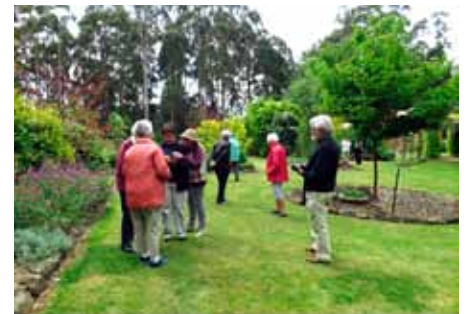
A recent visit to the Stanley area, where we were hosted by the Circular Head Gardening Club and taken to visit one of their superb gardens

The next general meeting of the Taroona Gardening Forum will be held on Wednesday 3rd February starting at 1930 hours at 1, Taroona Crescent, in the Uniting Church. As it is our first meeting of the year we have a get together with nibbles and drinks. New members are most welcome to join in this very informal event. It is a wonderful opportunity to get to meet the members and get a real feel for what we are about.