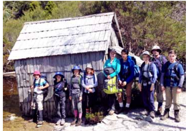
Cradle Mountain expedition

The Taroona Venturers continued with a busy program. Their bike ride from the Springs to Old Farm Road and Cascades via various fire trails and tracks proved more challenging than anticipated but a worthwhile activity nevertheless. A sea level walk and swim traverse of the northern part of the Alum cliffs was followed by a kayak sea traverse. Four venturers attended the State Venture at the Arm River camp on the Mersey River where they enjoyed a wide range