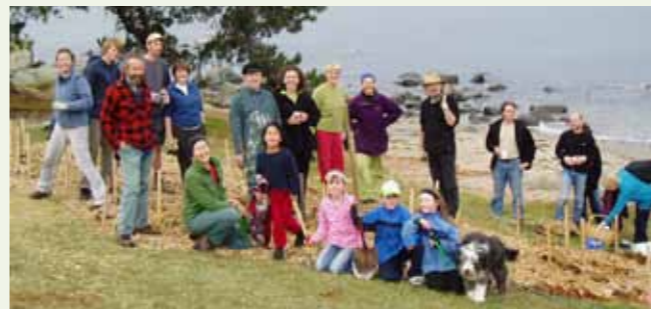
2003 Taroona high school foreshore. Recognise anyone you know?

It's hard to believe, but TEN have been operating for 18 years! In that time, we've restored biodiversity to our foreshore and gully reserves, removed thousands of invasive weeds, planted thousands of local natives, produced interpretive publications, coordinated community education events (Walkabouts and displays at Seaside Festivals, National Tree Days etc) and produced a website ( www.ten.org.au ). Amazingly, our core group still includes several original dedicated members.