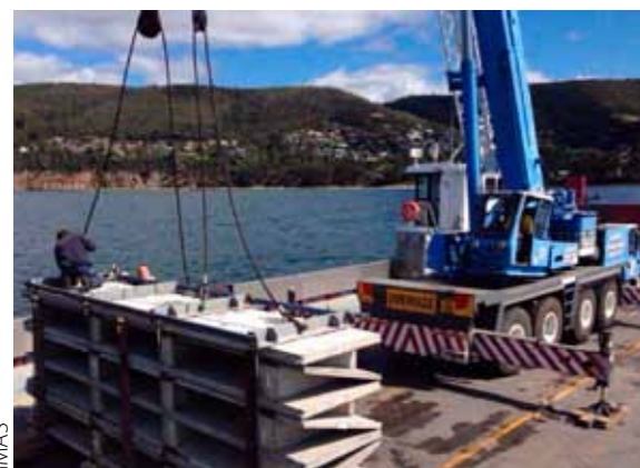
Artificial concrete reefs about to be lowered onto the sea floor off Taroona Beach

The first step in developing a floating reef for lobster farming was achieved last month when two concrete "reefs" were positioned 600 metres off Taroona Beach.