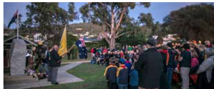
ANZAC Day Dawn Service, Taroona 2014