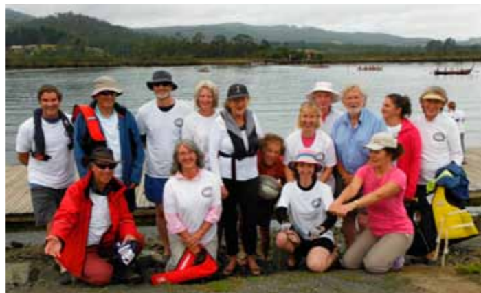
The fearsome Team Taroona

Since the launch, the Chiton has regularly rowed off the Alum Cliffs and appeared in a number of competitive engagements. The Swiftsure Regatta held in November at Franklin was the first competitive outing for the Chiton , where she raced against the other two Tasmanian St Ayles skiffs, Imagine from Franklin