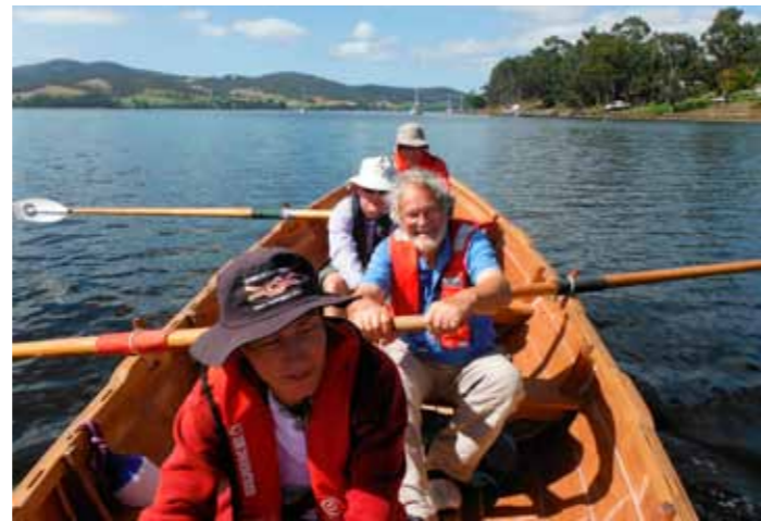
Heritage Long Row to Shipwright's Point