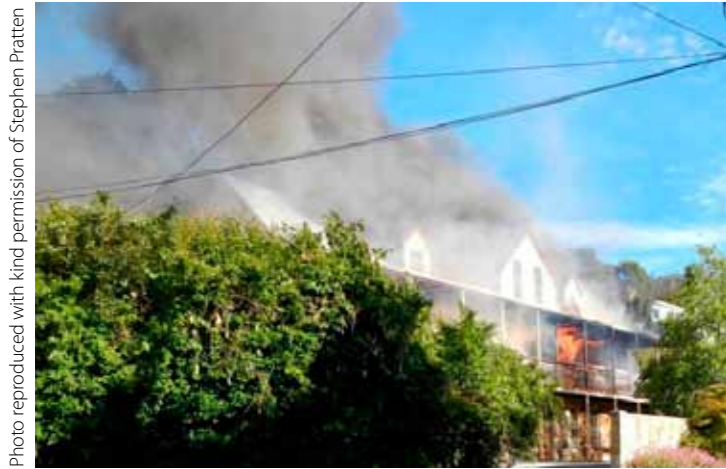
The Old Coaching Inn ablaze, 4 November 2014

The period between the September and March editions of the newsletter is traditionally one of the busiest for the Taroona Volunteer Fire Brigade. At the time of writing, this summer has been generally very quiet. There have been no serious bushfires in the State and the all work undertaken by the brigade has been carried out within the local area, apart from crews attending a vegetation fire at Runnymede near Buckland in November. There have been a number of small incidents ranging from dustbin fires to spiders behind sensors, but two jobs in Taroona received significant media attention.