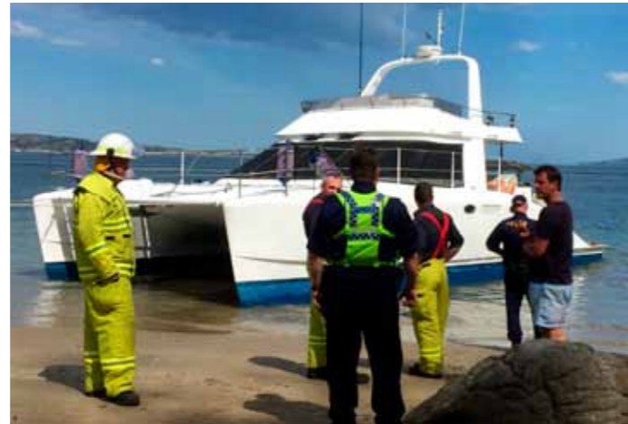
Catamaran diesel spill, 7 February 2015

At approx. 7.20am on 4 November a small fire broke on the deck of the Old Coach House on the Channel Highway. Both of the Taroona trucks responded and supported crews from around Hobart in controlling what was one of the largest fires in the suburb for a number of years. The Channel Highway was closed for two hours and a total of eight trucks attended. Fortunately, all occupants escaped without injury, but the house was sadly gutted. The very hot Saturday of the long weekend in February provided one of the more unusual call outs in the history of TVFB. The initial alert suggested a boat was leaking diesel on the boat ramp on Taroona beach. Brigade resources were stretched. The large