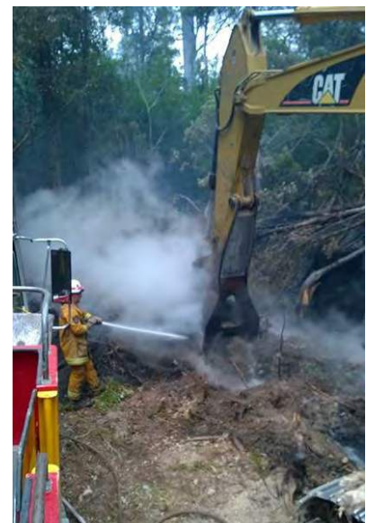
Our crew teamed up with the local forestry operator to get to the source of the fire.

Hopefully that way we can all sleep a bit easier.