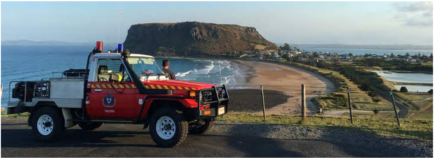
A long way from home.

Bush fires never seem to be far from our minds lately. The amazing summer weather has everyone swimming at the beach and climate scientists proclaiming, "I told you so." Taroona volunteers however have been putting in countless hours assisting our colleagues and communities in the North trying to subdue the plethora of fires consuming our pristine wilderness and small coastal Tasmanian communities.