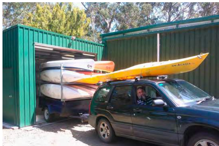
Group Leader Simon Stephens proudly backs a trailer laden with water craft into the extension – an easy operation compared to the past which involved manual manoeuvring between old walls and ceilings with very limited clearances.

You may have seen that Action Builders has completed the garage extension to the Scout Hall. The extension provides very much easier access to store our trailers and water craft and frees up an area for youth training exercises. The extension is possible due to a generous grant of $40,488 from the Tasmanian Community Fund that represents the majority funding of the