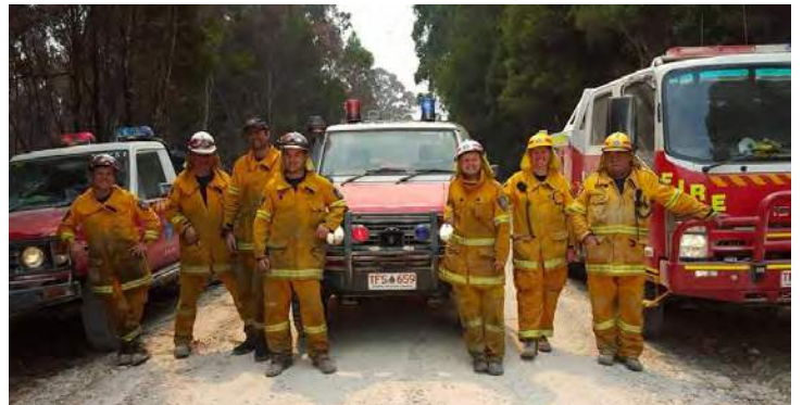
Taroona Brigade sharing the road with some other Tassie brigades.

The fire front was 350 km long on the 8 February and it was over 900 km long, 10 days later. That describes the enormity of the task. Every metre of that fire front, when contained, needs to be 'blacked-out' at least 50 m into the scrub. That is gruelling work, which rarely makes front-page news.