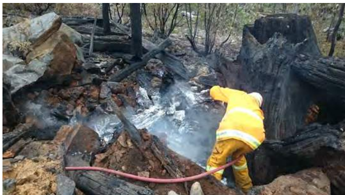
Just one of many charred trees.

Members of your brigade have been sent away on assignment for three or four day rotations for the last few months and have enjoyed the great hospitality of the people of Nunamarra, Mole Creek, Stanley, and Smithton.