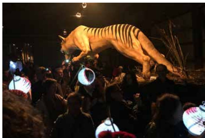
Taroona Joeys, Cubs and Scouts join the parade around the ogoh-ogoh at Dark Mofo.

at the Dark Park, which this year was in the shape of a Tasmanian Tiger.