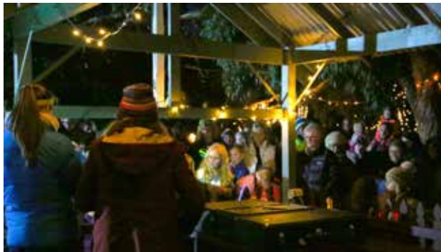
Musicians entertain the crowd at the Possums midwinter lantern parade

This issue conveys news of mid-winter gatherings – the passing of the Possums lantern parade, the invitation to the forthcoming Ember contemporary music festival at Taroona High School and the Giant Taroona Book