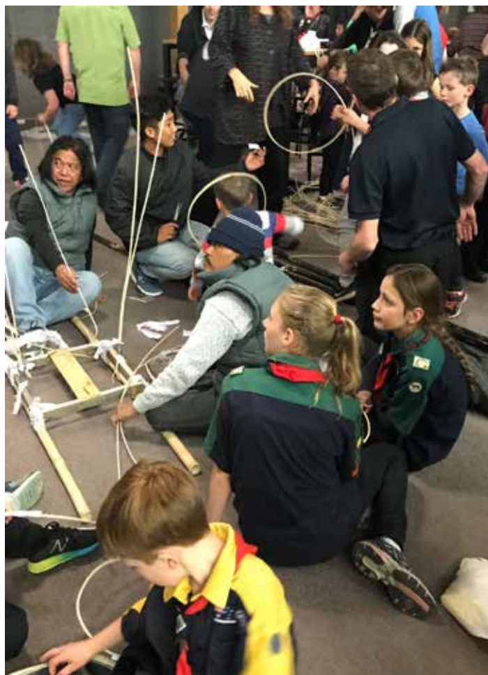
Preparing "eye" lanterns for Dark Mofo.

Scouting activities are wide and varied. The Joeys, Cubs and Scouts joined with Indonesian artists to contribute to the ogoh-ogoh project at Dark Mofo. It was a night full of fun and colour. The Joeys, Cubs and Scouts were fortunate to meet the ogoh-ogoh makers, three artists from Bali and Indonesia. They made their own ogoh-ogoh, created "eye" lanterns, learnt about Balinese Hindu culture and the meaning of the ogoh-ogoh and joined in a noisy, colourful procession to the Balinese ogoh-ogoh