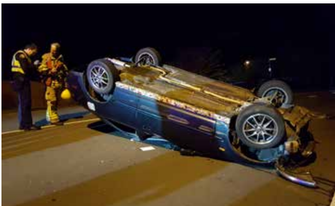
Two recent fires attended by the Taroona Volunteer Fire Brigade