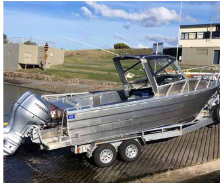
The new IMAS research vessel, Lowinna 3