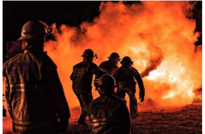
The Taroona Volunteer Fire Brigade training at Tasmania Fire Service's Cambridge facility

The fire was extinguished by a crew from Hobart and then Taroona joined the Hobart crew in breathing apparatus to fully cool any remaining hot spots. This teamwork has become a major focus of our training and the coordination and collaboration between the professionals and the volunteers really made for a success in