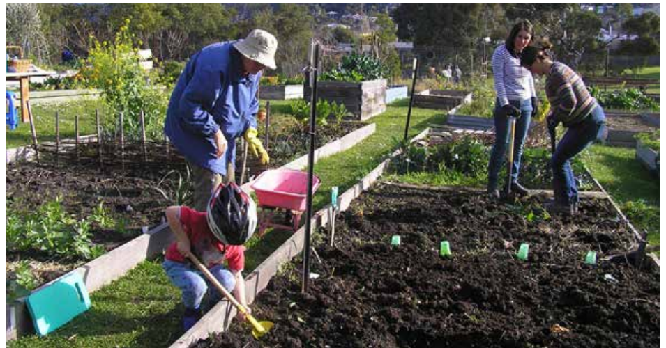
Fun in the Garden for all ages.