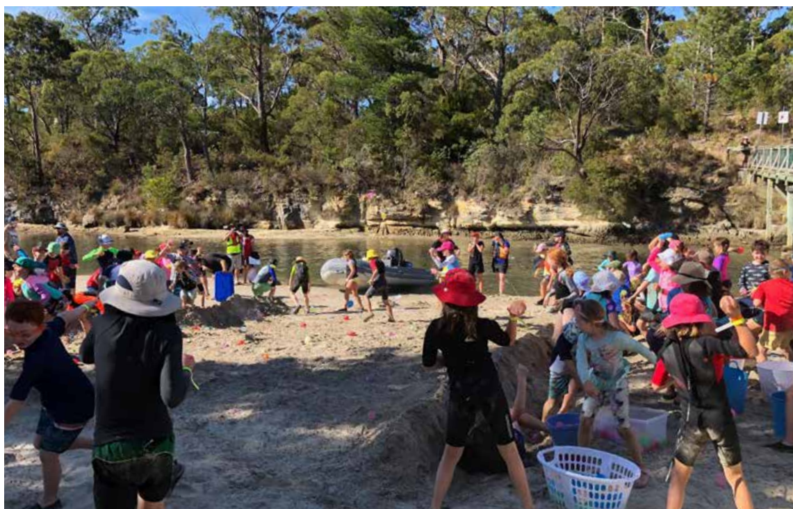
The Scout Regatta at Snug

Venturers have been lucky enough to nearly have a new room at the hall to meet in. They have painted it and are now looking for couches to put in it. As some new Venturers have linked up from Scouts, they had a mountain top investing ceremony with a magic moonlight walk. We had a joint activity with NW BAY Venturers,