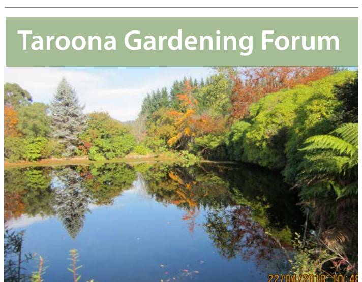
From an April Taroona Gardening Forum trip to Geeveston

Next Meeting 7:30 Wednesday 1st August 2018 1 Taroona Crescent (Uniting Church Hall)