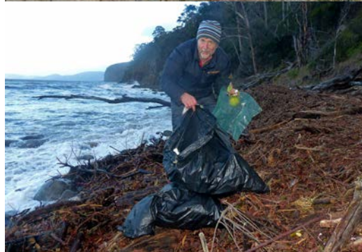
After the storm ...