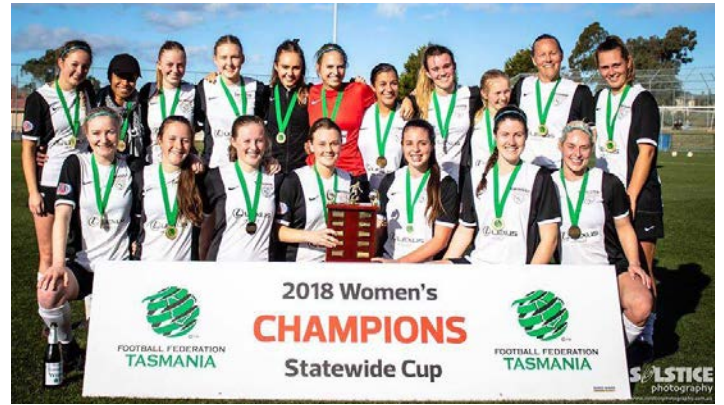
Statewide Cup Champions for 2018: the TFC's Senior Women's team.