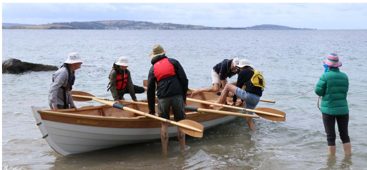
A comfortable launch ... who's a flexible sailor then ?