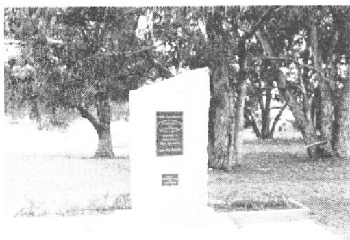
The new war memorial in Taroona Park.

Refreshments will be served in the Hall following the ceremony.