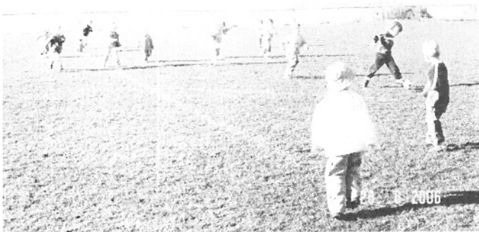
Little Possums enjoy their own World Cup soccer on Taroona's soccer field.