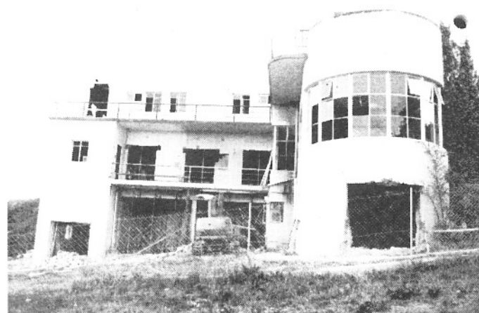
Taroona Hotel, October 2006

Construction of the two new buildings planned for the site, with townhouses and more apartments, is unlikely to start until well into next year.