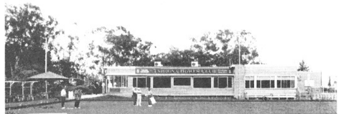
Players enjoy a late afternoon game at Taroona Bowls Club