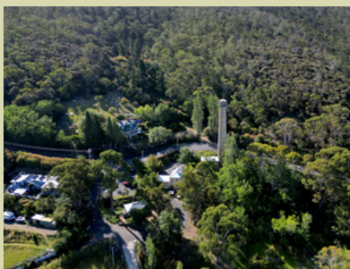
Taroona from above