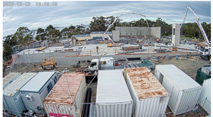
IMAS Taroona construction update on 3 March 2025.