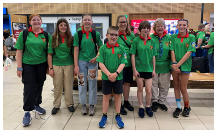
Above: 1/ Happy Family Campers at Judbury 2/ Off to the Maryborough Australian Jamboree 2025