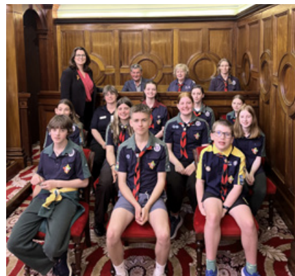
Left: Meg Webb MLC with Taroona Scouts representatives in the Legislative Council Chamber, Nov 2024