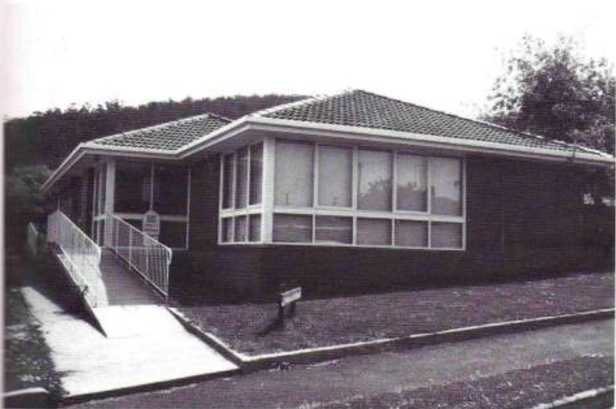
The Uniting Church, Tarooma Crescent, 1986.