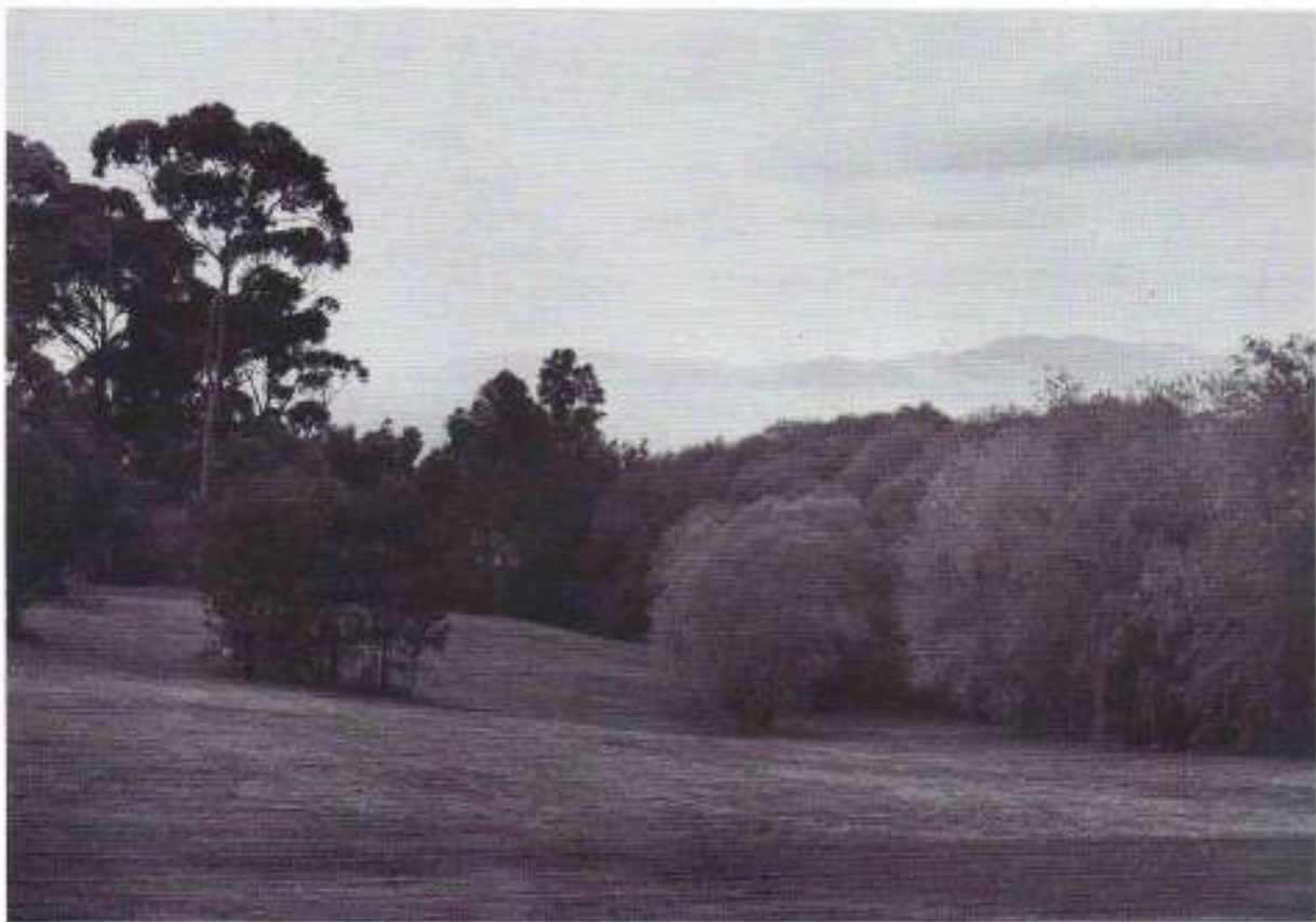
Looking east across Taroona Park, 1986.

There are families who have lived here all their lives and this strong rapport with the area is passed on to their offspring; even new residents are reluctant to leave. As a newcomer, I love the peaceful and tranquil atmosphere of the area and the walks along the Taroona beach with views of the Shot Tower, a reminder of the area's history and posterity.