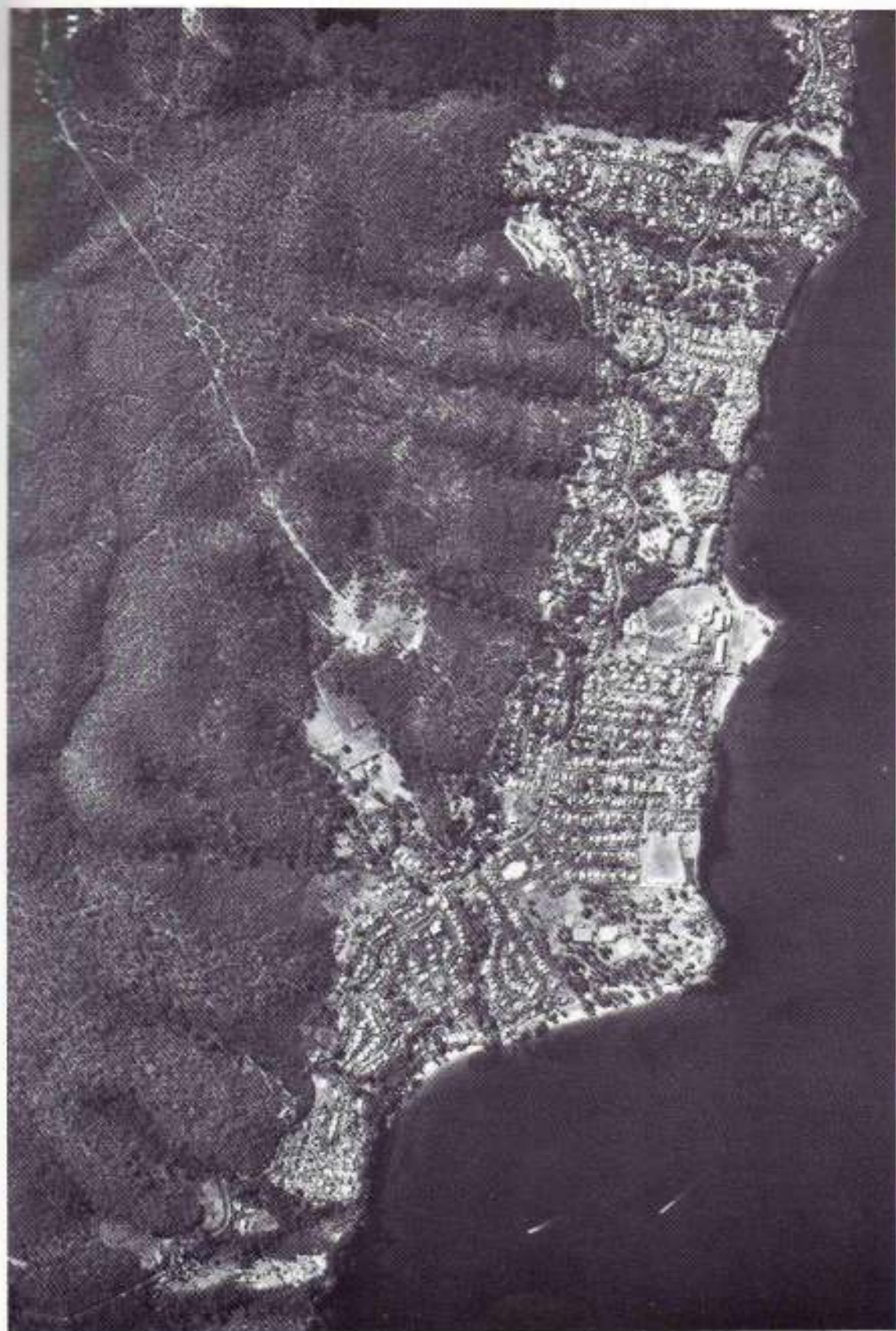
Aerial Survey from the Shot Tower in the south to Cartwright Creek in the north, March 1986.