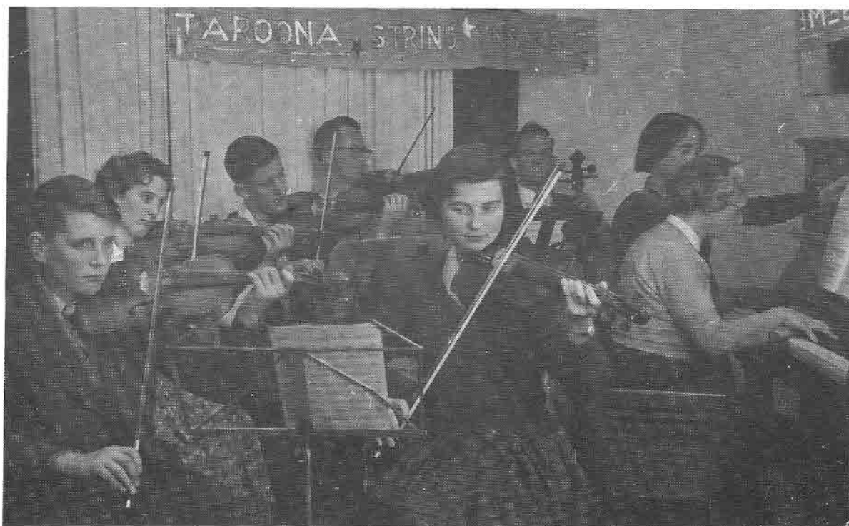
The String Ensemble c1953.