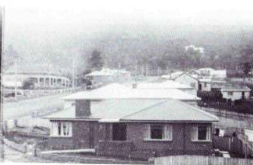
Panoramic view of Taroona Crescent, looking west towards the Channel Highway, c1948.