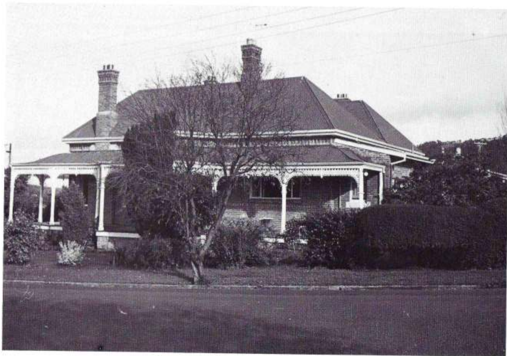
"Taroona House", number 17 Taroona Crescent, 1970.