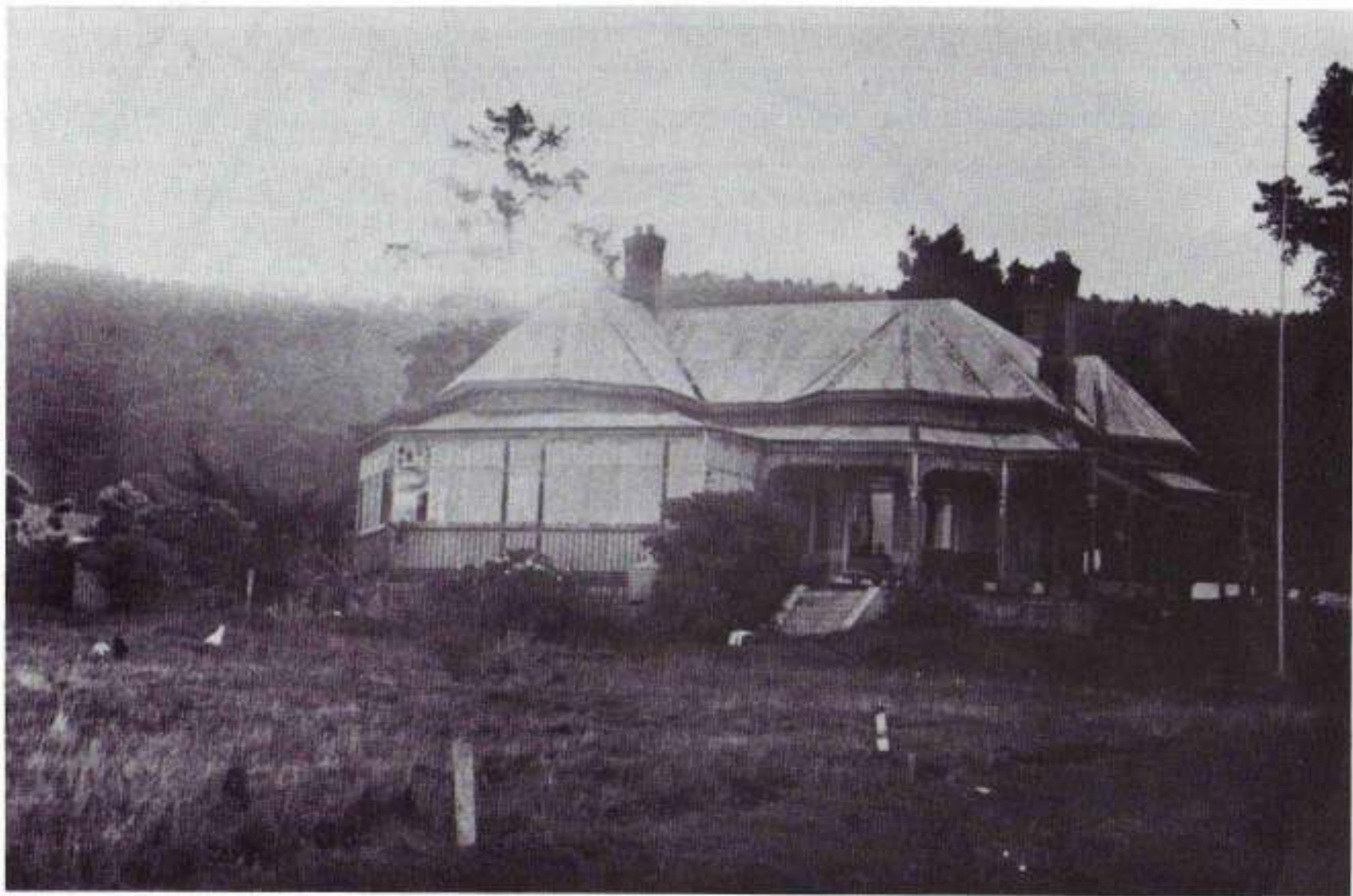
Taroona House c 1930.