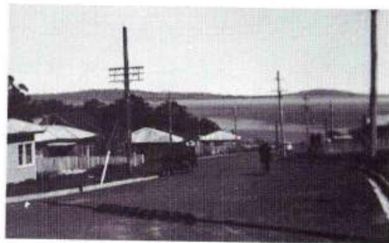
Entrance to Taroona Crescent, c1958.