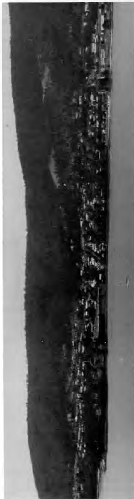
A modern-day aerial photo again showing most of the land taken up by the Norfolk Island Settlers, from the State High School in the north to the Alum Cliffs in the south.