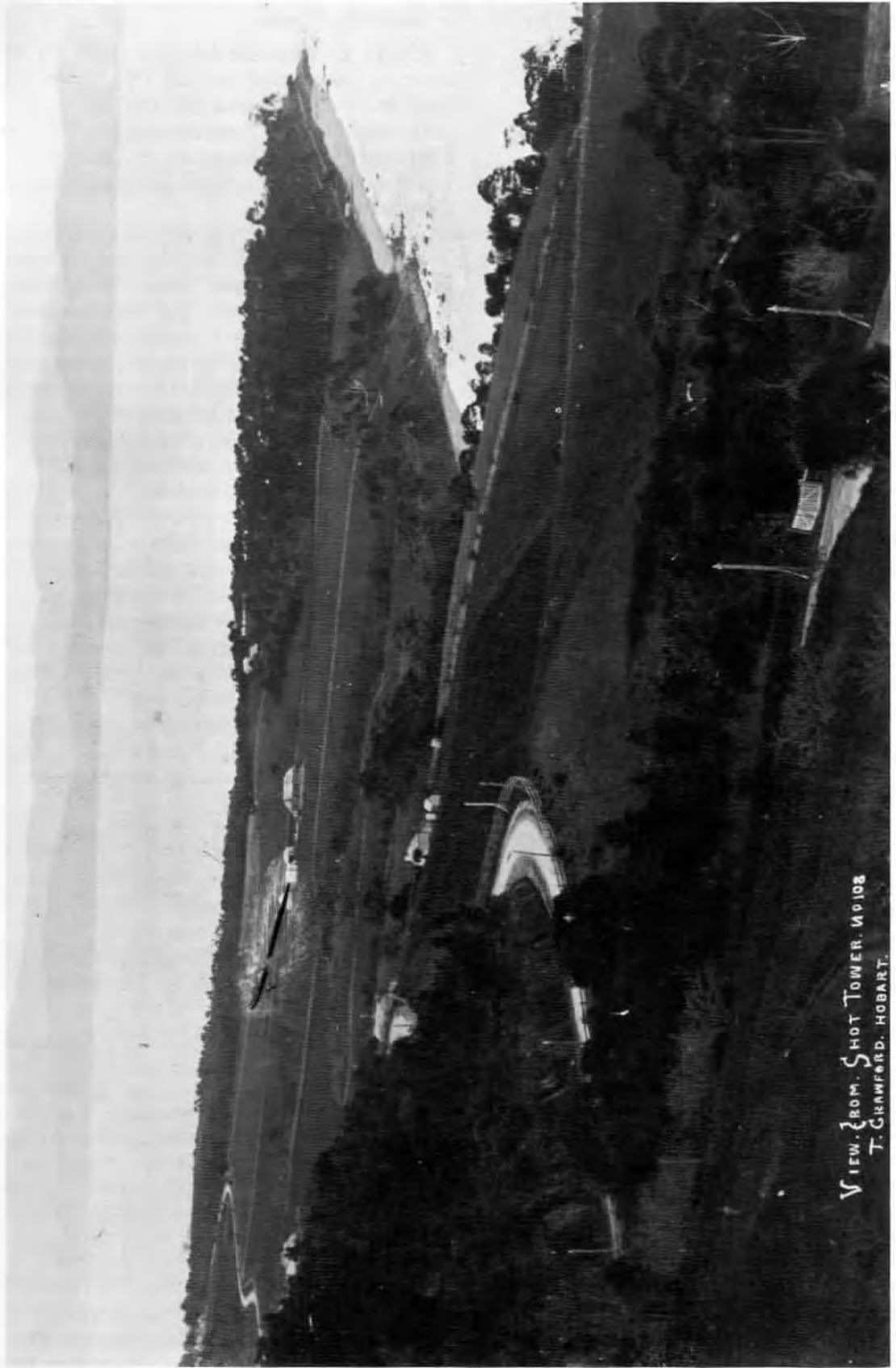
VIEW FROM THE SHOT TOWER. 1896.