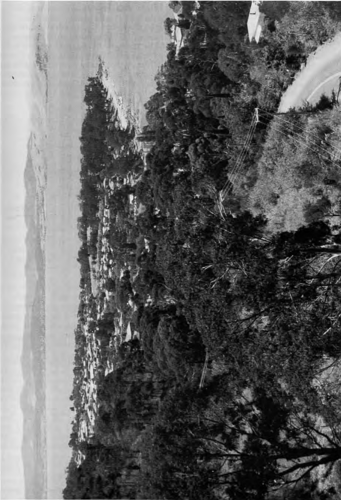
Looking North from the Shot Tower, 1986.