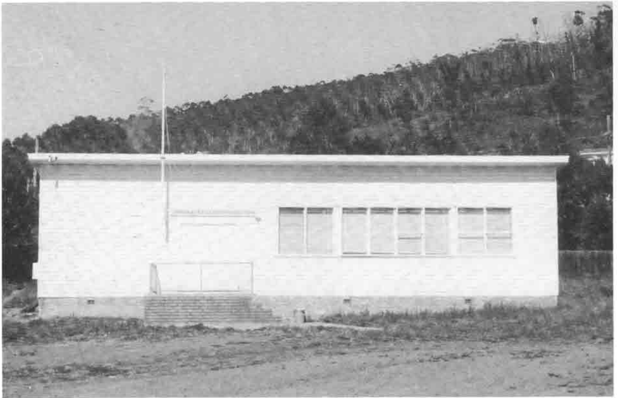
The Ex-Servicemen's Clubhouse shortly after completion, 1954.