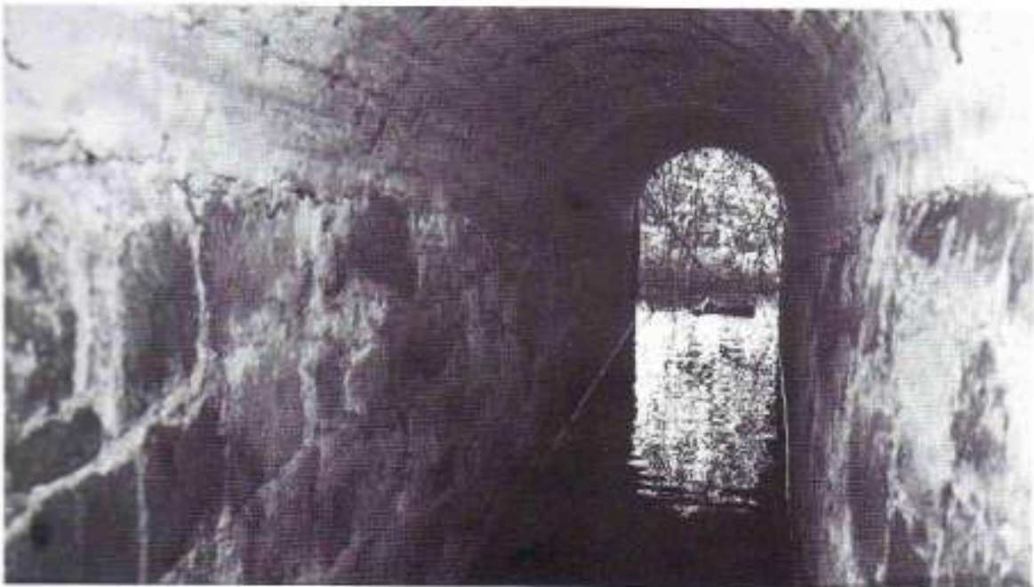
Exit to the Churchill Road Tunnel.

The creek which runs from the top of the hill behind Tarooma into the River Derwent at the northern end of Hinsby Beach follows Churchill Road for most of its journey. Water flows in the creek all the year and during the winter huge boulders are carried down the creek by the force of the flood waters. The creek was very clean with numerous big pools of sparkling water containing native trout, water cress and lily pads. These have now gone