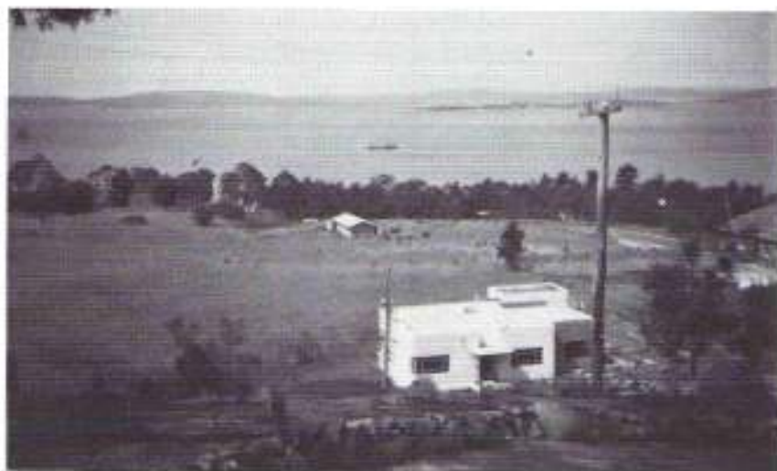
Site of Meath and Belhaven Avenue, 25th October 1941.