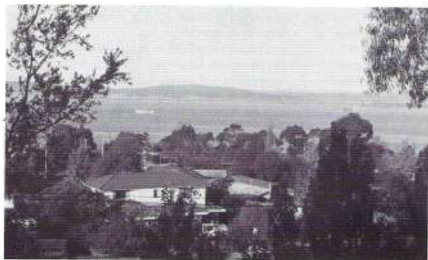
View over Meath and Belhaven Avenues, 1986.