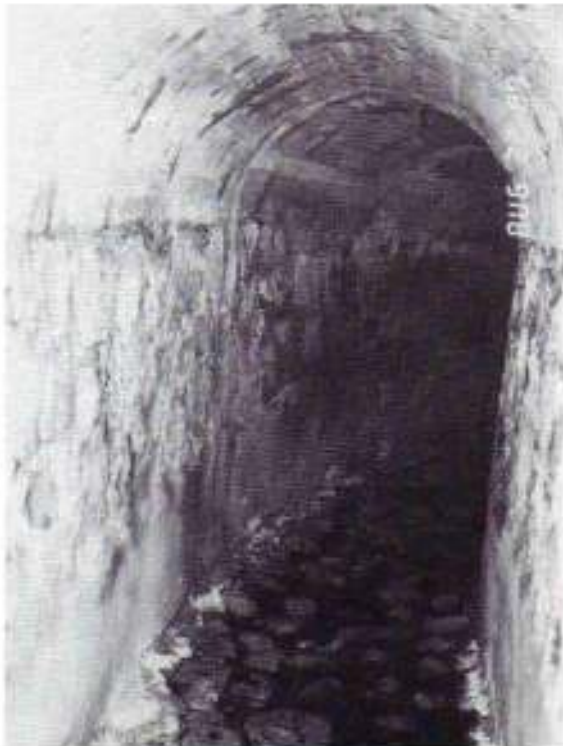
The cobblestone bed of the Churchill Road Tunnel.