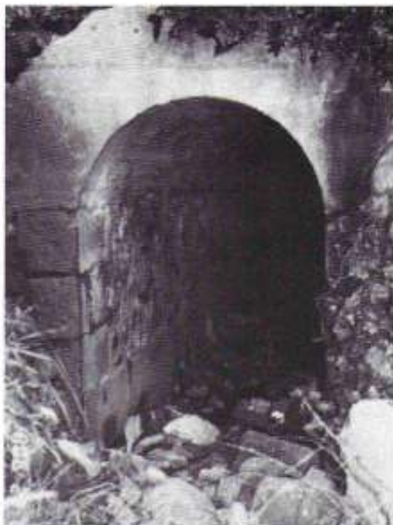
Entrance to the Churchill Road Tunnel.