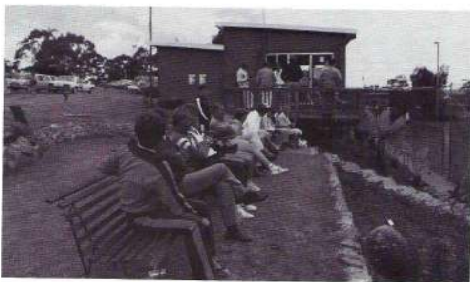
View of club house with tennis courts on the right and practice wall on the extreme left.