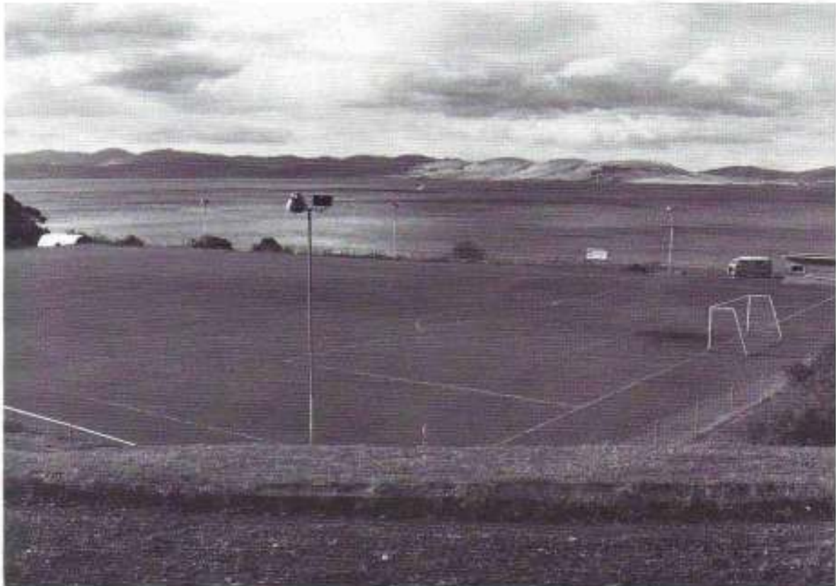
Kelvedon Park Soccer Ground, 1986.

The facilities now available in this district for soccer are recognised as one of the best in the state. Hopefully the club, ground, and its assets have served our youth and senior members in their endeavour to participate in their chosen sport.