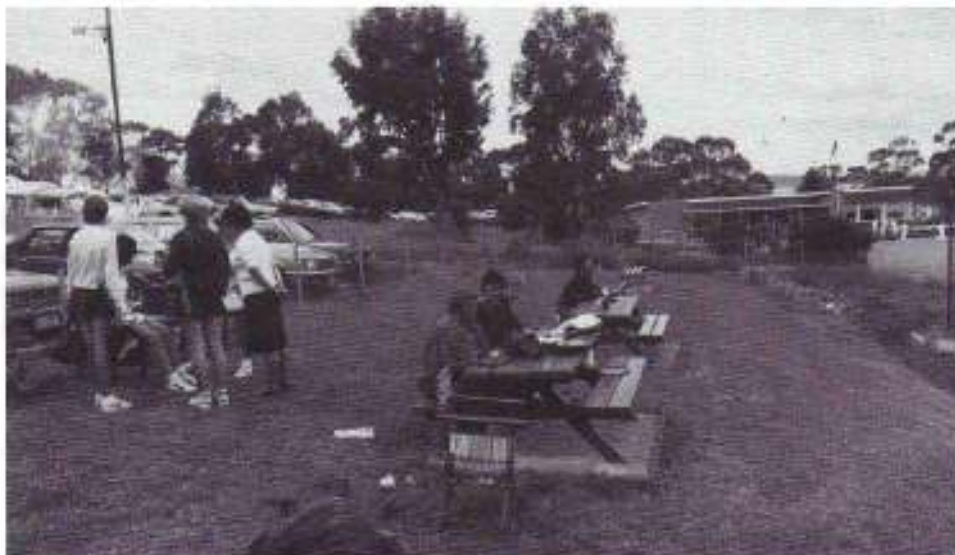
The grassy bank above the tennis courts, with the bowls club Club House in right background.

Other clubs in Hobart began to install artificial court surfaces at this time and a subcommittee was formed at Tarroona to investigate surfaces and possible means of funding. This committee recommended artificial grass and attempts were made to obtain the $60,000 needed for this project on suitable terms. However, the committee was unable to obtain the finance and in 1985 the idea was abandoned. Tarroona is now the only major suburban club with clay/gravel/en-