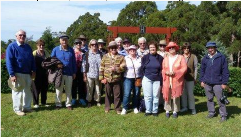
The gang at Hiba.

Our excursion to Bruny Island was a great success, with 23 aboard a little bus. We first visited the Killora Quarantine Station; then enjoyed a BBQ lunch beside the Channel in Pirates Bay, and we then visited the extensive beautifully landscaped waterside-gardens of Tiba, south of The Neck, and filled our pockets (and faces) with delicious fudge from the little shop there.