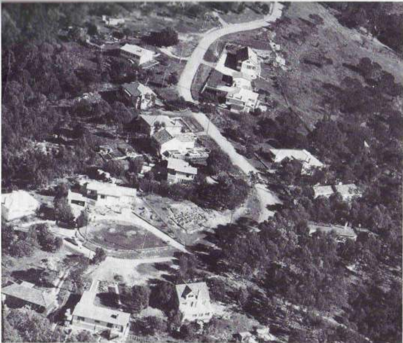
Taronga Subdivision from the air, 1962.