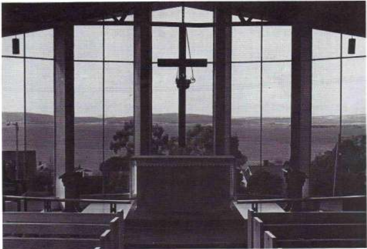
The new Sanctuary in the east end of St. Luke's Church Hall, 1986.