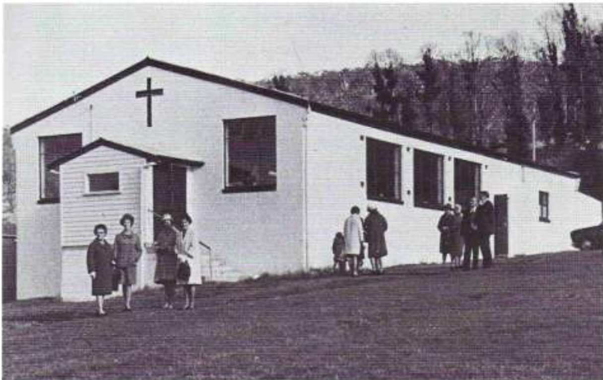
East end of St. Luke's Church Hall, 1965-66.