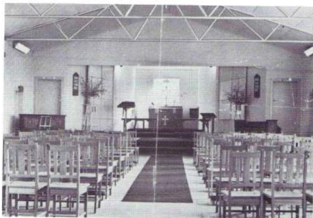
Stage and Sanctuary in the west end of St. Luke's Church Hall, 1957.