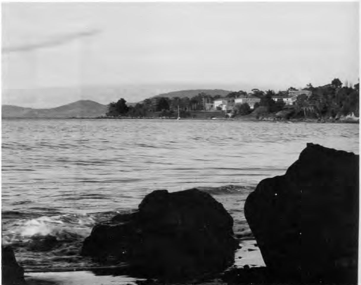
The site of "The Retreat" today, taken from the same location where Mary Morton Allport painted her watercolour, illustrated on the previous page.