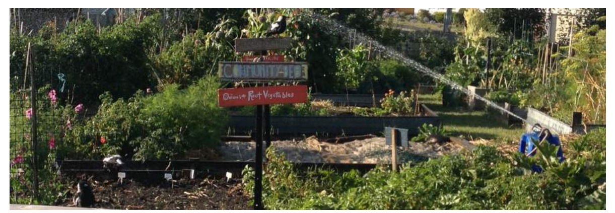
Our resident family of magpies enjoying a shower – well 3 having a shower, the fourth was hogging the bath! Was hot last Thursday.

Find monthly planting notes and keep up to date with