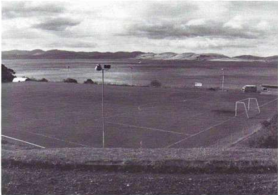
Kelvedon Park Soccer Ground, 1986.

The facilities now available in this district for soccer are recognised as one of the best in the state. Hopefully the club, ground, and its assets have served our youth and senior members in their endeavour to participate in their chosen sport.