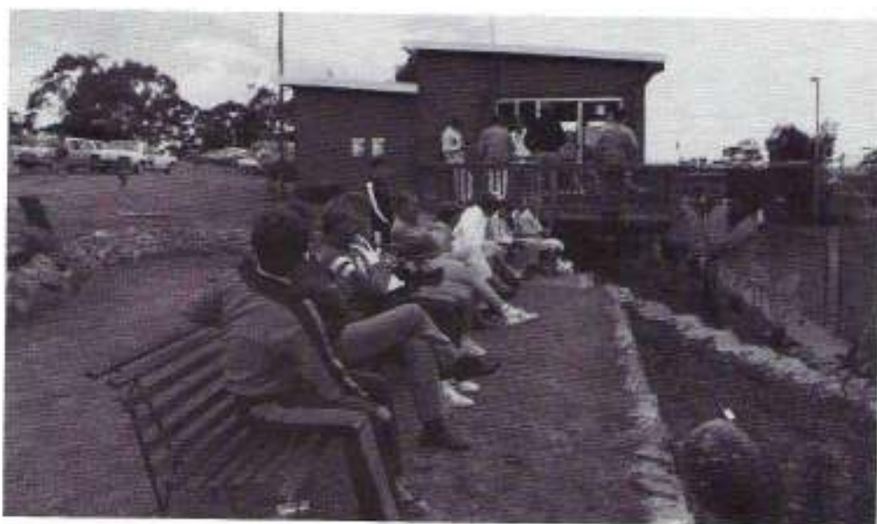
View of club house with tennis courts on the right and practice wall on the extreme left.