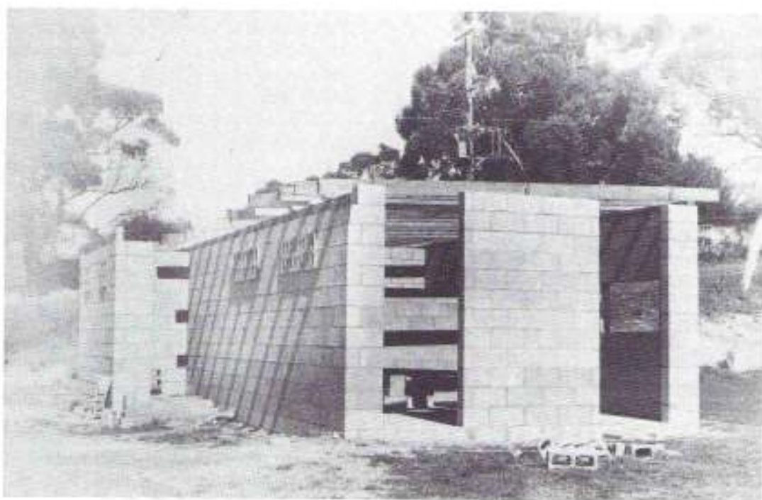
Facilities under construction at Kelvedon Park Soccer Ground, 1978.

Fencing around the ground play area was badly needed to avoid loss of balls, which are a costly item, and to keep cars off the playing surface. Once again the Council assisted with materials and club members erected the fencing.