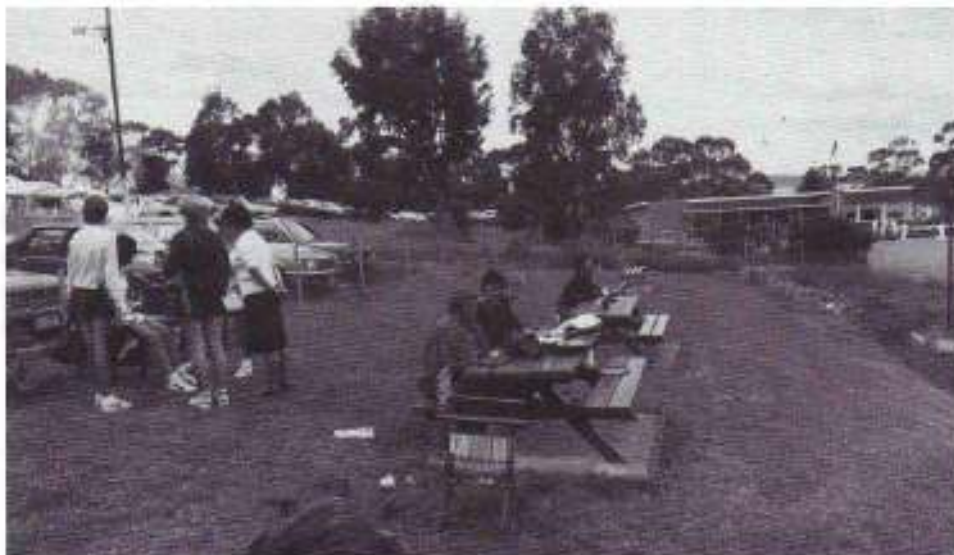
The grassy bank above the tennis courts, with the bowls club Club House in right background.

Other clubs in Hobart began to install artificial court surfaces at this time and a subcommittee was formed at Tarroona to investigate surfaces and possible means of funding. This committee recommended artificial grass and attempts were made to obtain the $60,000 needed for this project on suitable terms. However, the committee was unable to obtain the finance and in 1985 the idea was abandoned. Tarroona is now the only major suburban club with clay/gravel/en-