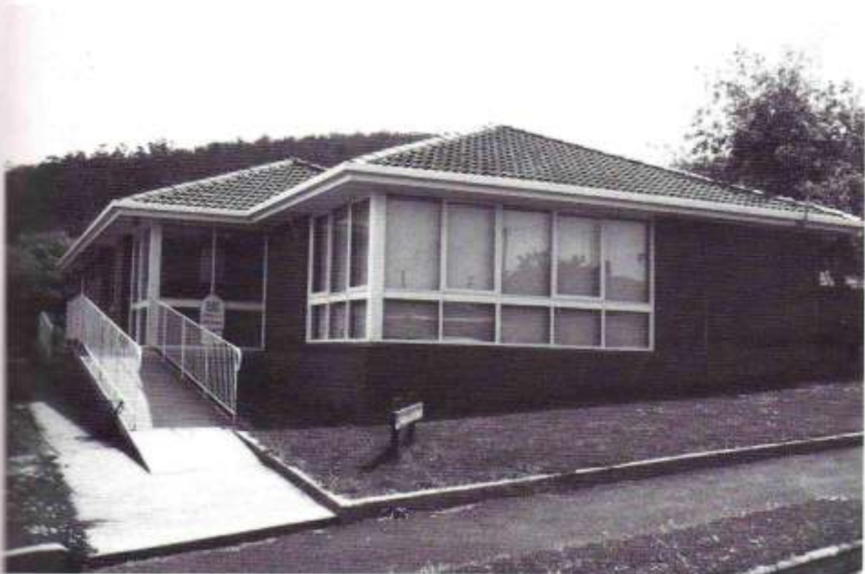
The Uniting Church, Tarooma Crescent, 1986.