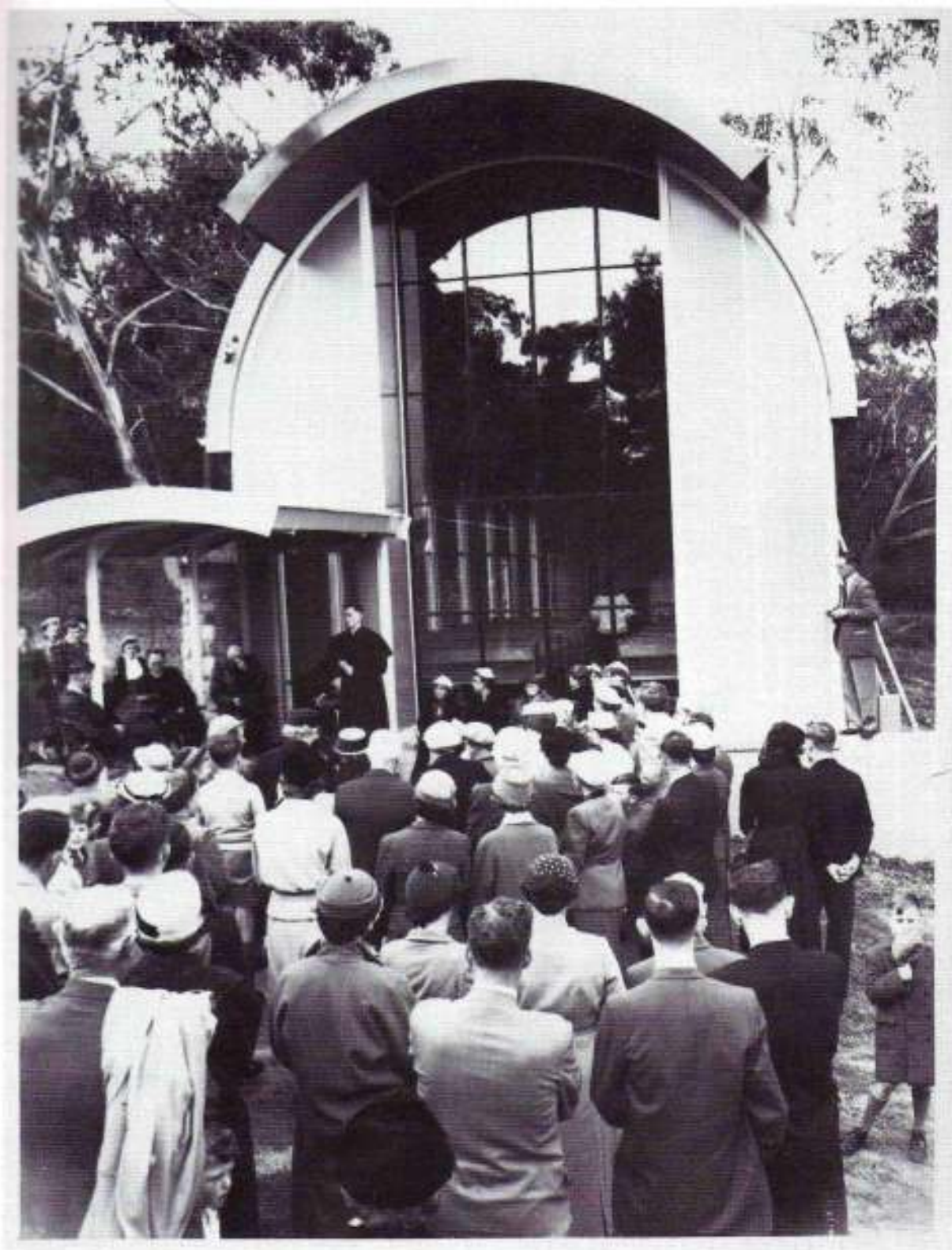
The opening of ST. Pius X Church on the 26th October 1957. PHOTO "THE MERCURY".