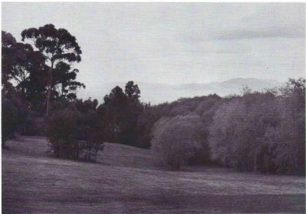
Looking east across Taroona Park, 1986.

There are families who have lived here all their lives and this strong rapport with the area is passed on to their offspring; even new residents are reluctant to leave. As a newcomer, I love the peaceful and tranquil atmosphere of the area and the walks along the Taroona beach with views of the Shot Tower, a reminder of the area's history and posterity.