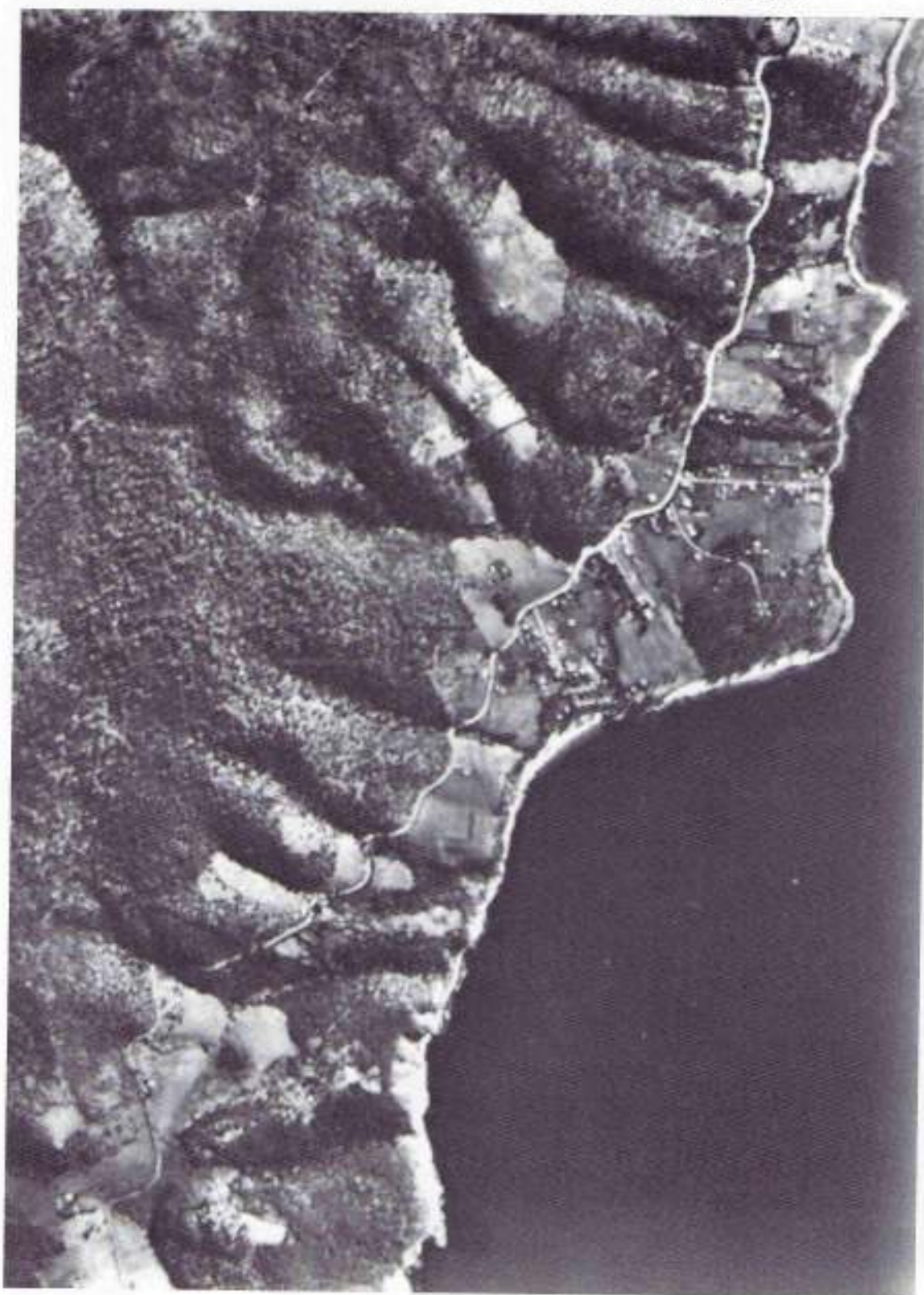
Aerial Survey from the Probation Station in the south to Winmarleigh Avenue in the north, March 1946.

PHOTO TASMAN: DEPARTMENT OF LANDS PARKS AND WILDLIFE