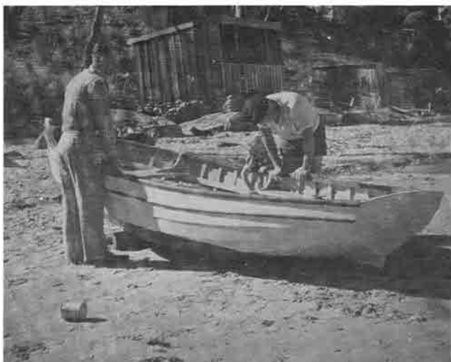
Taken on Hinsby Beach in 1938, with boat sheds on the right, and an open-fronted shelter which had built-in tables and seats for picnic parties. This was built by the Progress Association which functioned from about 1930-1940 and was used by it to hold its committee meetings.