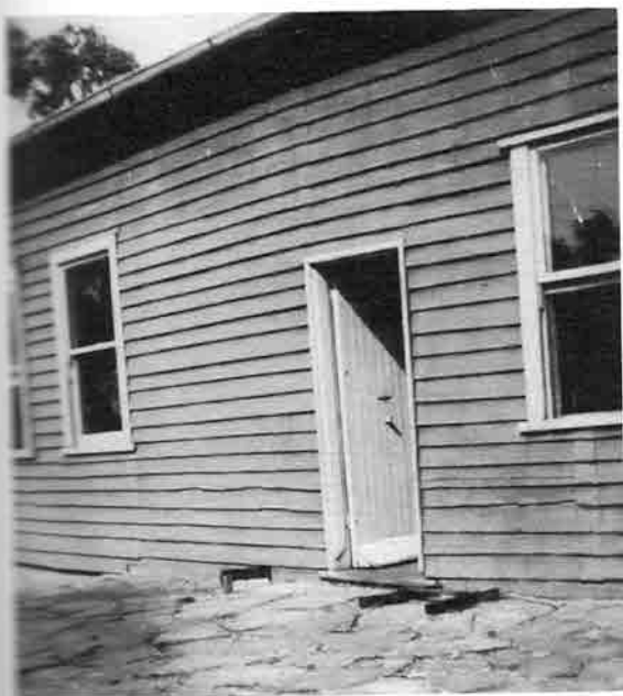
The entrance to the main building, c 1945.

The popularity of the Tarooona Youth Camp has been again shown during the year. the committee handled approximately 1,140 persons at one-day picnics, and 575 who spent periods ranging from 2 days to 4 weeks at the camp.