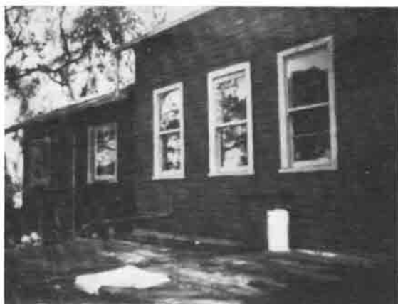
Back of the main building which faced the River Derwent, 1950.