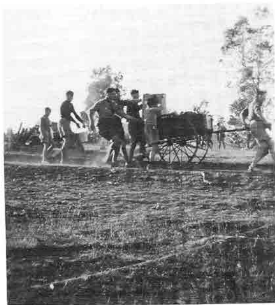
Scouts wheeling their trek-cart down the hill into the Rotary Youth Camp.