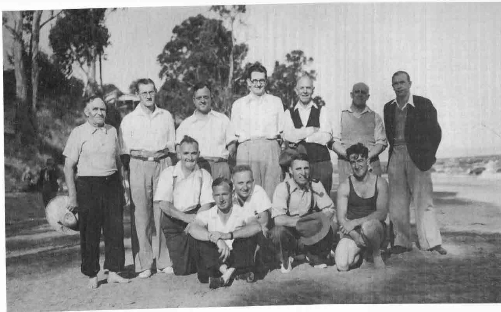
The First Progress Association