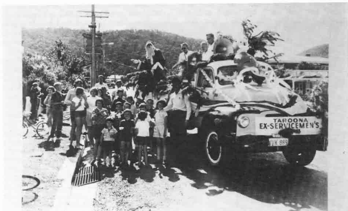
Father Christmas on his annual tour, distributing sweets and ice creams to children in Winmarleigh Avenue, 1966.