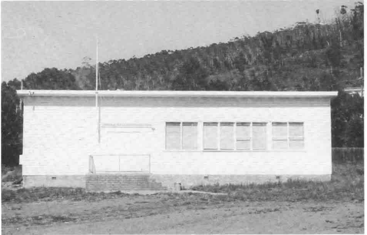
The Ex-Servicemen's Clubhouse shortly after completion, 1954.