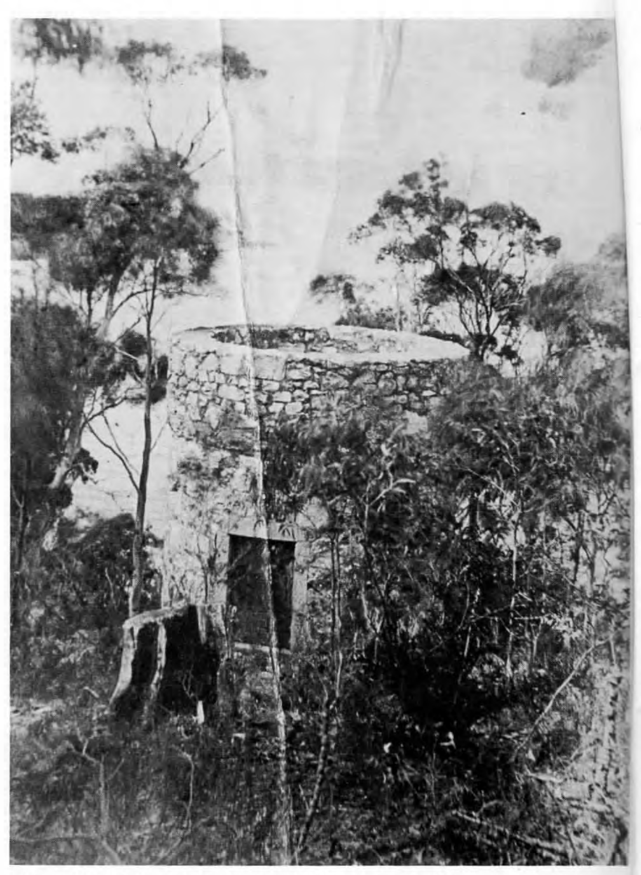
The store for arsenic, antimony, sporting and blasting powder, 1930.