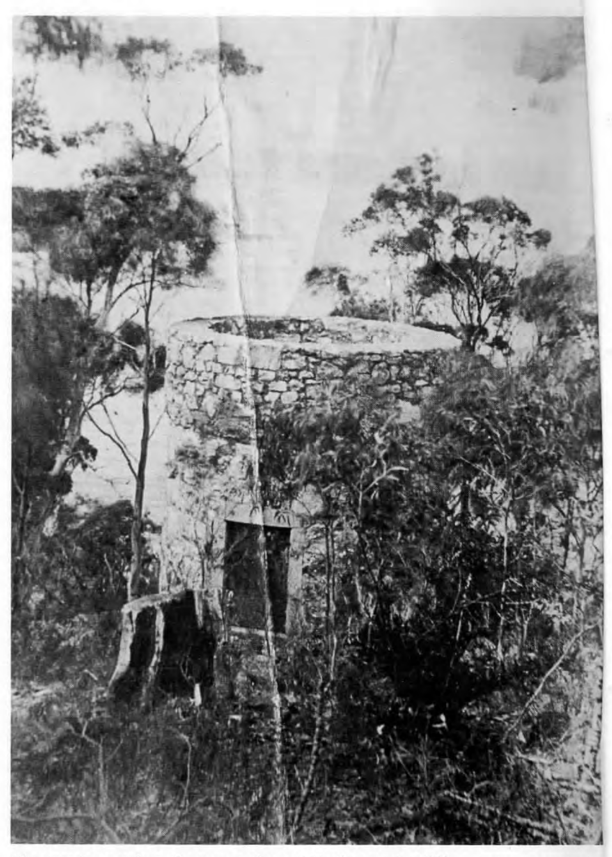
The store for arsenic, antimony, sporting and blasting powder, 1930.