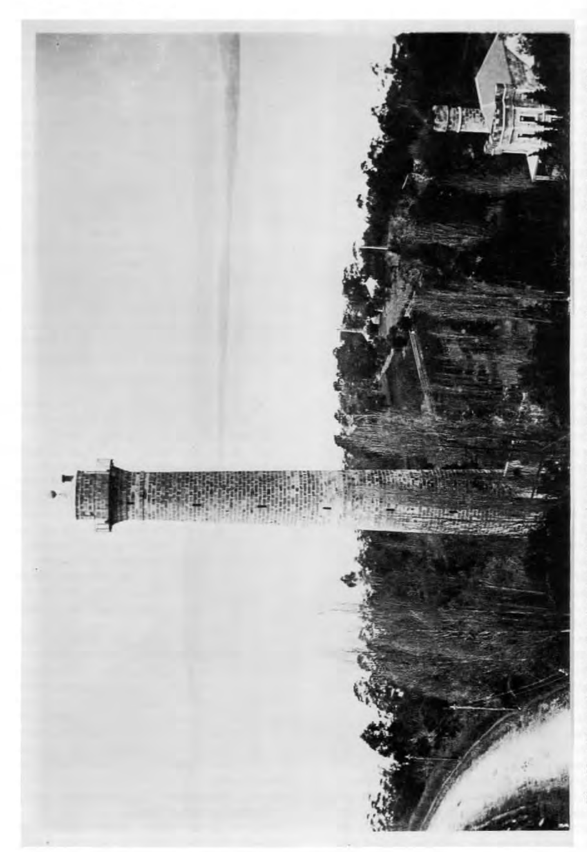
The Shot Tower Property showing the building for melting arsenic, lead and antimony, with its tall chimney in the middle background and the Conservatory to its right. Taken between 1880 and 1882