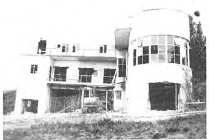
Taroona Hotel, October 2006

Construction of the two new buildings planned for the site, with townhouses and more apartments, is unlikely to start until well into next year.