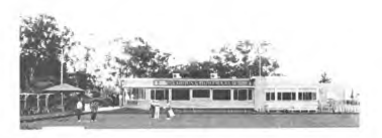
Players enjoy a late afternoon game at Taroona Bowls Club